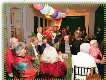
Guests Enjoying Live Music