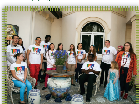
Barron Collier High School Choir